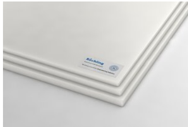
Polystone® PVDF HG natural

For more information about technical data, product handling, certifications, compliance or delivery program scan the QR-Code and visit our website or talk to our experts.